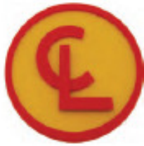
Camp Lewallen Silva, Mo.