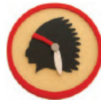
Camp Sakima at S bar F Scout Ranch