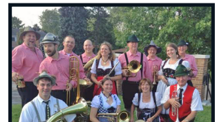
SCHNAPPS UND TANZ OKTOBERFEST BAND