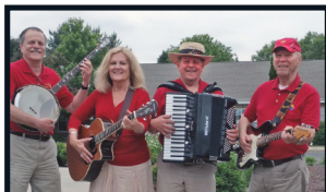
LITTLE BIT OF HEAVEN

SILENT AUCTION • LIVE BANDS • RAFFLE • COMMEMORATIVE STEIN CORNHOLE TOURNAMENT • COLD BEER & DELICIOUS FOOD FOR PURCHASE!