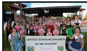
UNITED DONAUSCHWABEN OF MILWAUKEE DANCERS