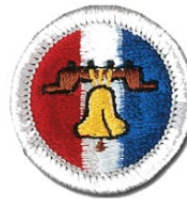
Citizenship in the Nation