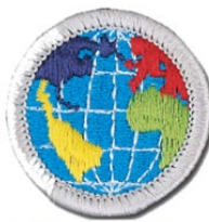
Citizenship in the World