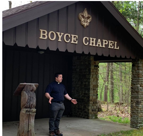
Sunday Chapel Service

A non-denominational Scouts' Own service is conducted Wednesday evenings at 7:00pm at the chapel. The chapel is also available anytime for units, patrols, or individuals who wish to hold their own services during the week.