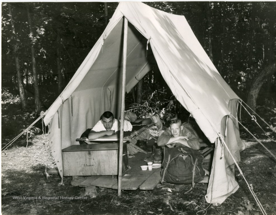
Scouting has been a tradition at Camp Mountaineer since 1954

As a nationally accredited summer camp owned and operated by the Mountaineer Area Council, BSA, Camp Mountaineer offers a familiar community environment with big opportunities! Thanks to the generous support of the Hazel Ruby McQuain Charitable Trust among other partners and donors, Camp Mountaineer offers many unique facilities from a 60-foot climbing and rappelling tower, to a top-level shooting sports complex, to a quarter mile zip line. With over 60 quality merit badge instruction sessions, a renowned first-year camper experience, and an abundance of extra program activities, summers at Camp Mountaineer are the perfect place for Scouts to have the time of their life.