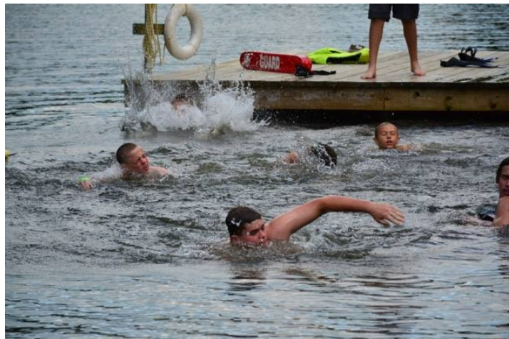
Scouts working on their Swimming merit badge

To help expedite the check-in process, Camp Mountaineer encourages units to complete their BSA swim tests before arriving at camp. All pre-camp BSA swim tests must be administered by a certified BSA Aquatic Instructor, BSA Lifeguard, Red Cross Lifeguard, or professional swim instructor or swim team coach. Pre-camp BSA swim tests must be properly documented using the Pre-Camp Swim Check Form (available online at macbsa.org/camping/summer-camp ) and include a clear copy of the test administrator's credentials with their signature and the unit leader's signature. When swim tests are conducted outside of camp, the Camp Aquatics Director retains the right to review or retest any or all participants to ensure that standards have been maintained.