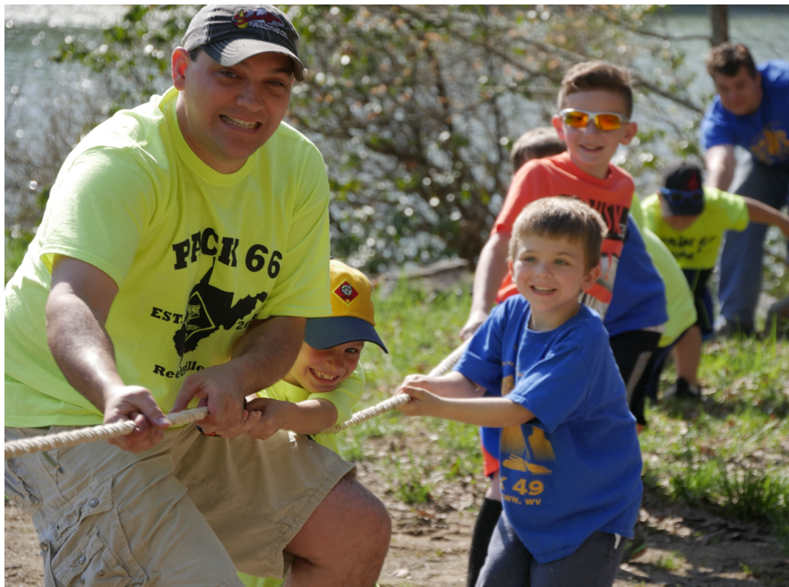
Cub Scout Resident Camp

All youth participants must meet proper age guidelines and be registered in the Boy Scouts of America to attend Camp Mountaineer. Units may not bring underage or unregistered youth to camp.