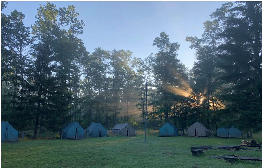
Sunrise at Mingo campsite

Units may request to share a campsite with another specific unit by emailing summercamp@macbsa.org with their request. Both units must still submit a reservation, pay a deposit, and provide two-deep leadership .