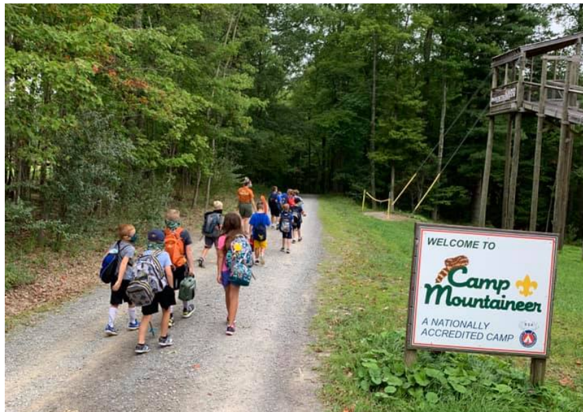
Scouts excitedly arriving at camp

Upon arrival at Camp Mountaineer, Scouts will be greeted in the main parking lot by their unit's assigned staff guide. While gathering in the main parking lot, units should load all their gear, including individual's gear, into a single vehicle or trailer to help prepare for transportation into camp. By this point, a unit leader should have collected all the BSA Annual Health and Medical Records for every youth and adult participant staying in camp (in alphabetical order).