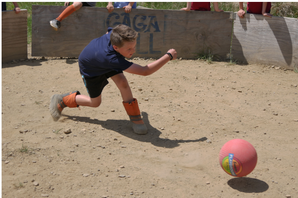
Gaga ball is always a popular activity at camp

The camp wide speed limit is 5 mph. Pedestrians have the right of way at all times. Passengers may not ride in the bed of trucks or in trailers. Vehicles are prohibited from driving under zip lines (near the Trading Post) when in use. Reckless driving will not be tolerated. Any driver found in violation of these rules or operating their vehicle in an unsafe manner may be removed from camp property.