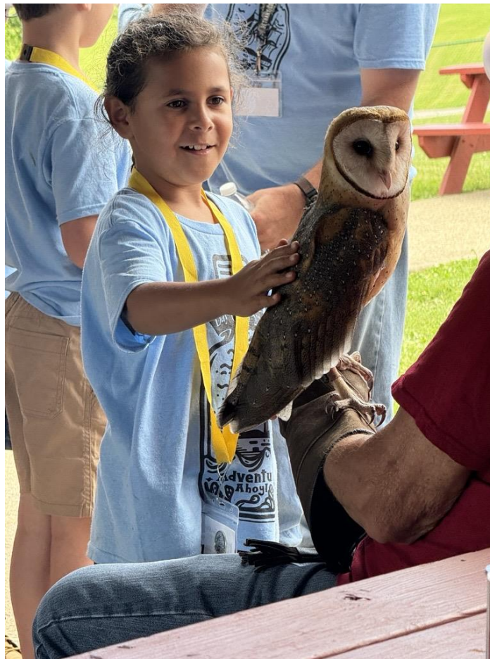
Scouts meet special visitors during special programming

Any special dietary needs or food allergies should be listed when registering online for camp. Cub Scout Day Camp staff strive to accommodate any needs with appropriate substitutions, within reason, when notified well in advance of arrival at camp.