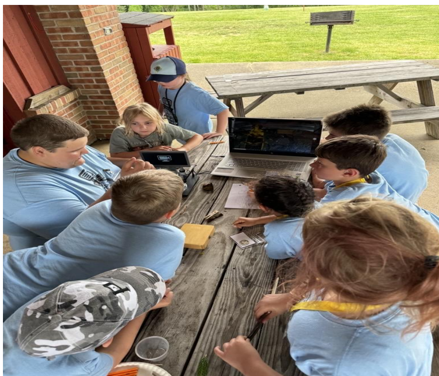
STEM (Science, Technology, Engineering, and Mathematics) at Scout Day Camp

Not a registered member of Scouting America? Day Camp provides non-registered youth the opportunity to become new members while experiencing the fun of Cub Scouting. Scouts can earn their recruiter patch by inviting non-Scouting friends to register for Day Camp!