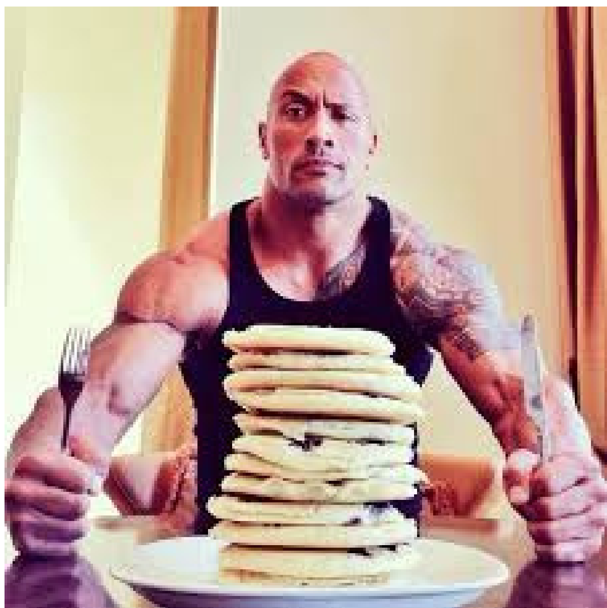
“The Rock” eating pancakes