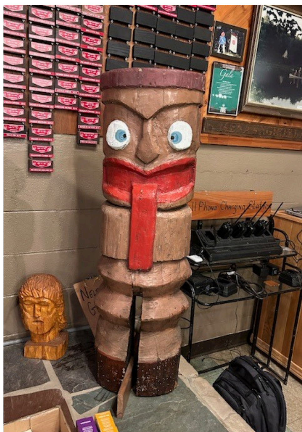
The Kabeezum Totem at Camp Mountaineer