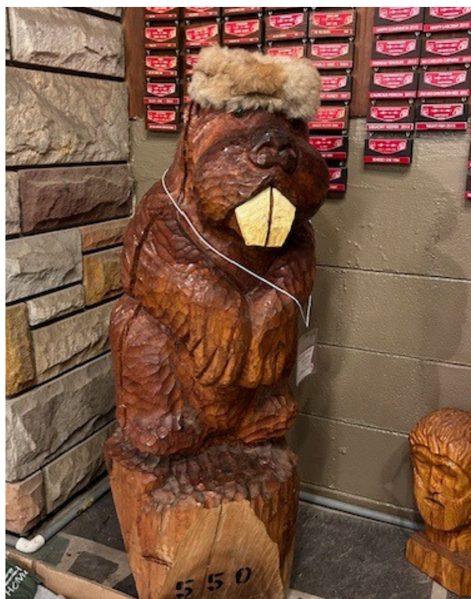
The Bucky Beaver Totem at Camp Mountaineer