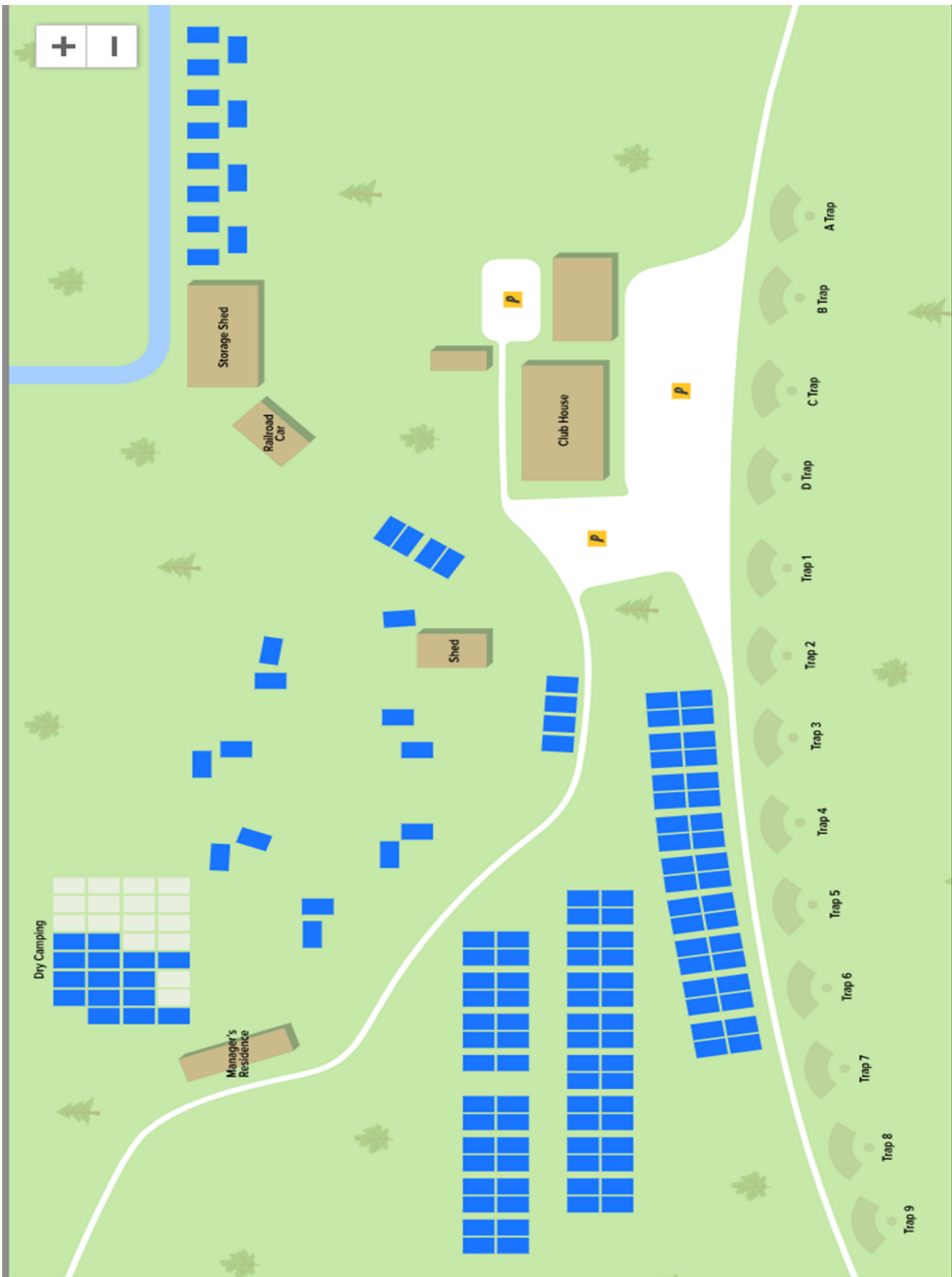
Map of Evergreen Sportsman's Club.

Blue rectangles represent RV and dry camping spots.