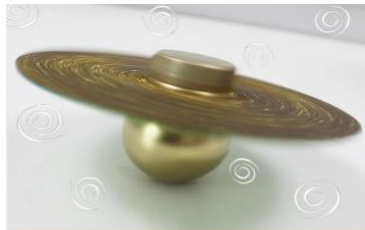
SPiNNiEST TOP EVER!

** All ranks will make Wiggle bots and tops to reinforce our 2024 STEM Program.