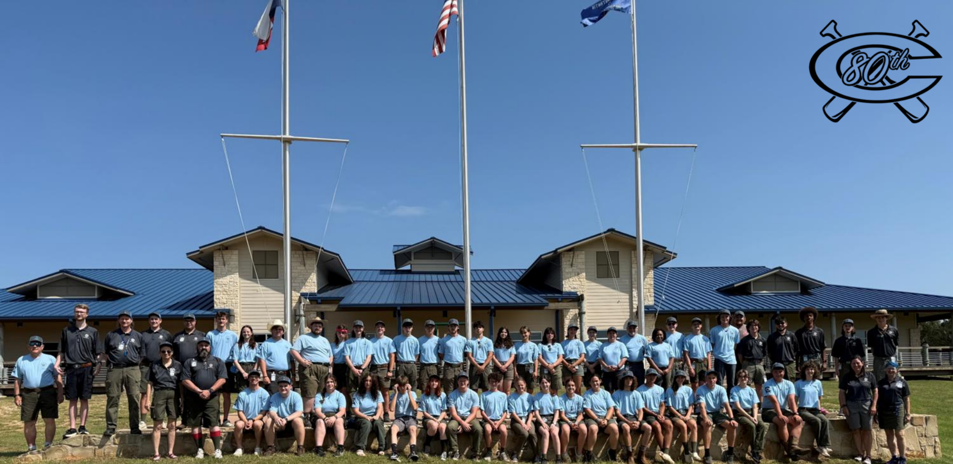
Camp Constantin Staff 2025