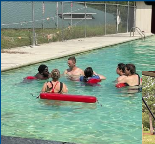
Open Areas 9-10, Tu/Th