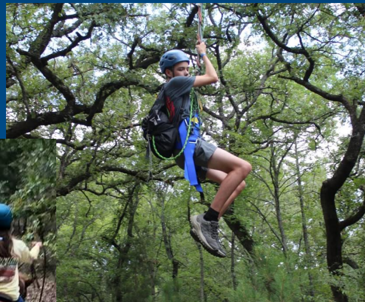
Ziplining and MORE!