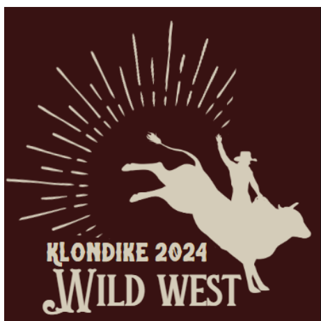
Back large design