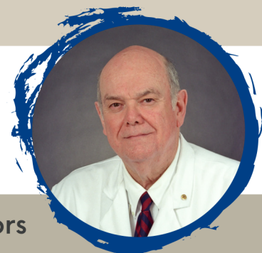
Dr. Paul Caudill Memorial Campership Fund Presentation

Thank you to our 2023 Diamond Eagle Club Sponsors