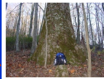
110' tall, 5' diameter yellow-poplar