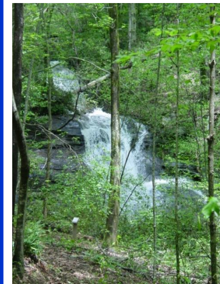
Waterfall on East Perimeter Trail

NOTE!! Entry into Greenville Watershed lands prohibited! Stay on trail—Adult leader or staff must be present.