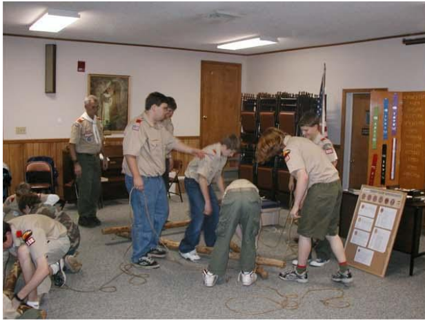
Patrols pull together to assemble their A-frame "Walkers." They work as quickly as possible but need to make sure their lashings are tight.