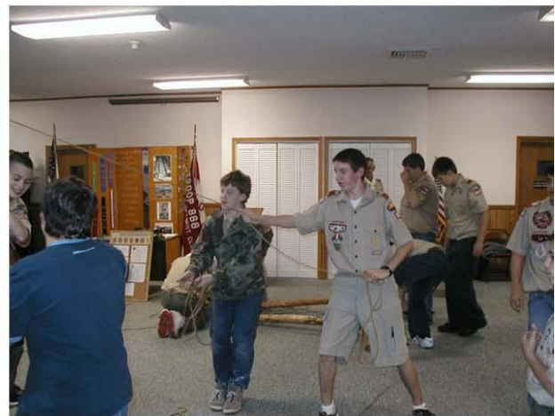
The patrol is now challenged to keep their "Walker" standing while their patrol member attempts to move the A-frame and himself across the pit.