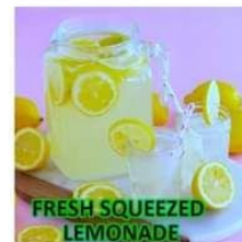
FRESH SQUEEZED LEMONADE