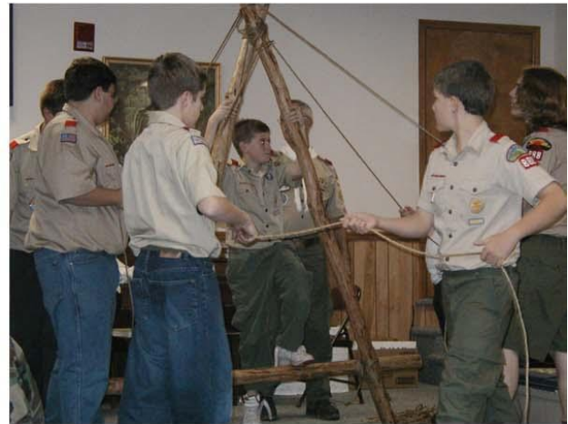
After the A-frames are built, the guy lines have to be attached, and their "Walker" needs to be stood up with their first patrol member balanced and ready to cross the "Alligator Pit."