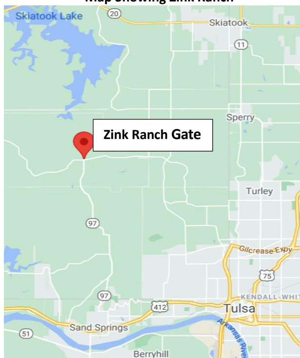
Map Showing Zink Ranch