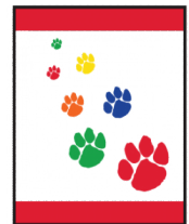
Paws on the Path