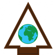
Building a Better World

Please Preregister for Flag Ceremony Participation.