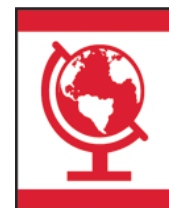
Finding Your Way