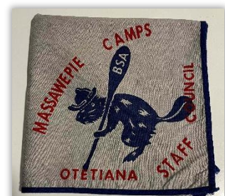
1960 Camp Voyageur staff neckerchief