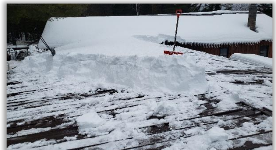
Up to 4 feet of snow on the Maintenance Shop roof!

Since there is no National Camp School this year at Massawepie, join us to help finish projects and prepare camp before Scouts and Staff arrive! Meals will be provided June 23-27 out of Gannett Lodge. Be sure to RSVP!