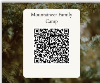
QR code link to HipCamp registration for Mountaineer Family Camp

Family Camp at Mountaineer is open for rentals from July 3rd through August 9th this summer. You can use the QR code to link to the HipCamp registration page. We will have a renovated office space this year with a small trading post and historical section. We are looking forward to this summer and hope to see many of you there.