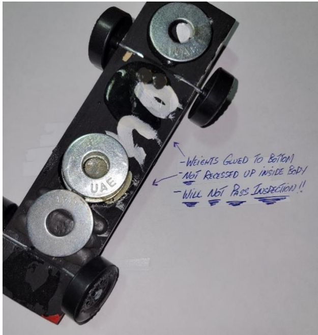
Figure 1 - Underside of Car (Illegal)