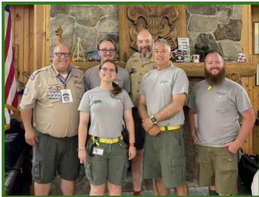
Six Camp Gorton Program Directors, past and present, spanning nearly 30 years all found themselves back at Camp Gorton on the same day!

In addition to your salary, housing, and meals, members of Camp Gorton's Staff join a family of current and former staff members who share this life changing experience. Many Scouters credit Camp Gorton for skills they use each day in school and their careers. Anyone interested in applying to work at Sunny Camp Gorton should fill out the staff application online at: