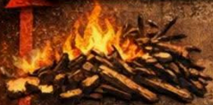
Brush & Debris