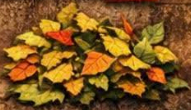
Leaves & Yard Waste