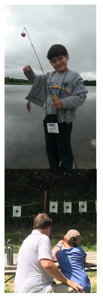
New this Year, Cub Scouts will be working towards the Cub Scout Shooting Sports award for BB Guns and Archery!