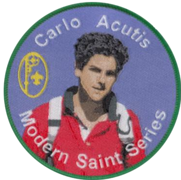
Patch earned at afternoon religious vocation station