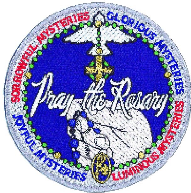
All Cub Scouts and those American Heritage Girls and Girl Scouts of the USA who do not participate in merit badge classes with the Scouts BSA Scouts will earn this rosary patch