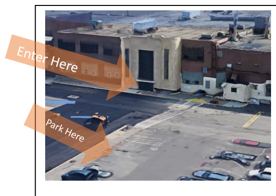
Figure 2 – View of SWR office - Looking South