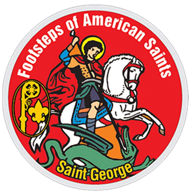
All scouts earn this patch during morning rotation