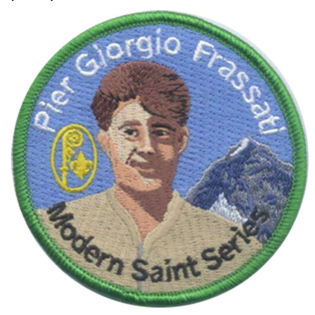
Religious Vocations Station, Option 1