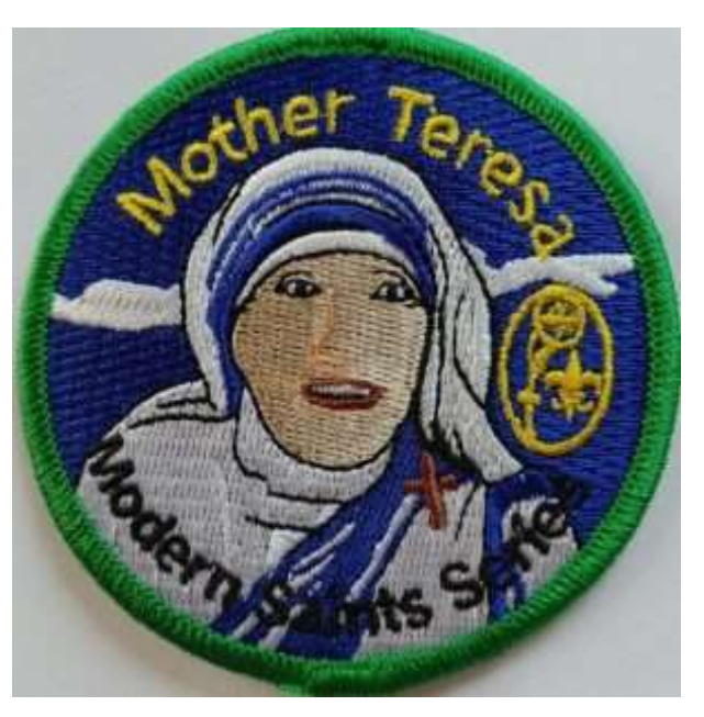
Religious Vocations Station, Option 2