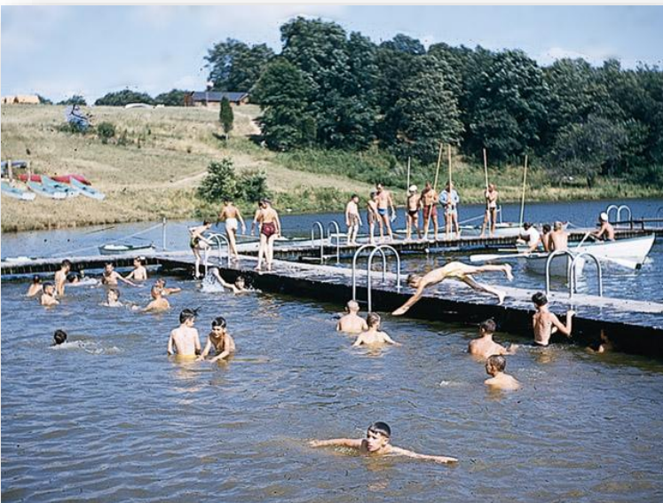
Figure 1 Swimmers enjoy relief on a hot day at the Camp Saffran Pier on Lake Strauss, Summer 1959

No portion of the reservation larger than nine acres has ever been sold or lost. The Council recognizes Broad Creek's value for youth education, wildlife observation, backpacking, hiking, and other challenging Scout programs, and has striven to support these many uses. Little did the camp founders know in 1948, seventy years later, every acre would become invaluable to the success of the overall camp program, whether that land lay in the core of camp or in the "buffer" areas near the camp boundary. Baltimore's suburban sprawl has placed increasing pressure on all sides of BCMSR for the past several decades. Recent efforts with the Harford County Land Preservation and Federal Forest Legacy Programs will help assure that the property will remain undeveloped in perpetuity. Broad Creek has become one of the last locations near Baltimore where youth and adults can learn outdoor skills and enjoy a remote wilderness experience.