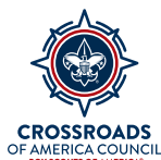
CAC Program Assistant camping@crossroadsbsa.org