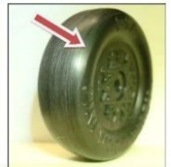
Not good – Fluting not visible