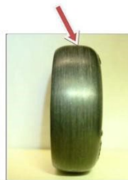
Not good – Beveled or rounded tread