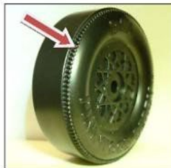
Good – Fluting visible