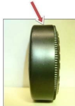
Good – Flat tread