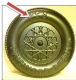
Good – BSA markings visible