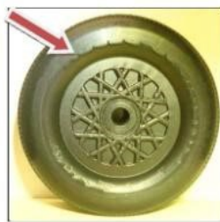
Not good – BSA markings not visible