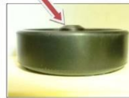
Not good – Beveled or rounded hub