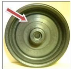
Not good – BSA markings not visible