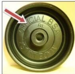
Good – BSA markings visible