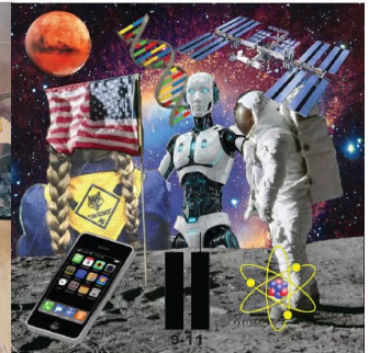
Cub Scouts + Preorder