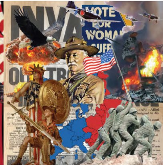
Older Scouts + Preorder