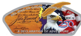
Promotional Patch + Preorder

Check out the commemorative Council Jamboree Patch Set! More information...coming soon!