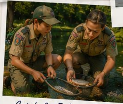
Catch & Release Ethics