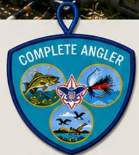
LEADING TO THE COMPLETE ANGLER AWARD