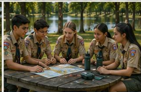
BUILD FRIENDSHIPS THAT LAST