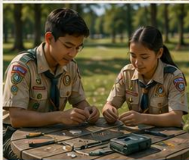
LEARN NEW SKILLS