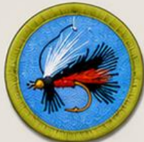
FLY FISHING MERIT BADGE