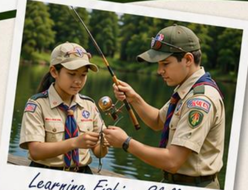
Learning Fishing Skills

Fishing Program Committee Greater California Council