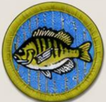
FISHING MERIT BADGE

SCOUTING AMERICA • GREATER CALIFORNIA COUNCIL