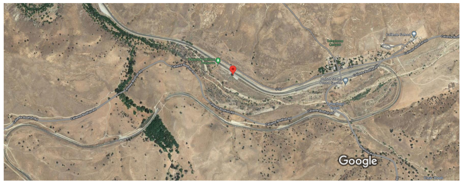
500 ft

Turn left across from post office and follow the railroad tracks going west. Do not cross the railroad tracks.