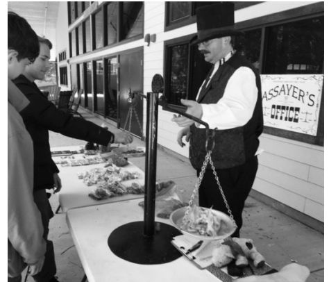
Trading Gold for Provisions