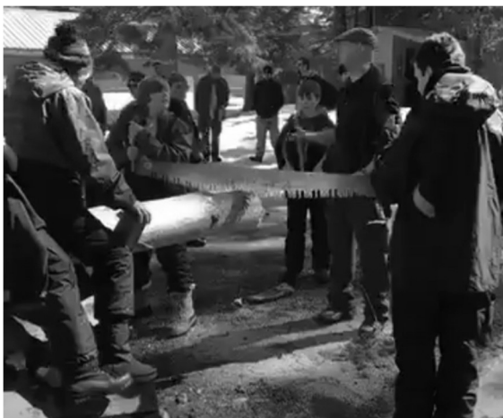
Cutting Logs at the Dawson Lumber Mill

It may be a good idea to plan a unit snow camping outing prior to the Klondike where your scouts can have a trial run setting up their gear in the snow while staying close to the cars. Once at Klondike, they will be hiking nearly a mile in the snow to get from the parking area to their campsite. Better to find any issues ahead of time.