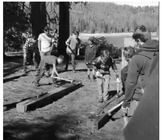
Driving Spikes at Caribou Crossing

Register online at www.seqbsa.org/klondike-derby/ .