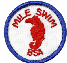
BSA Mile Swim Afternoon only