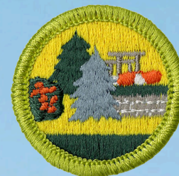
Landscape Architecture Merit Badge