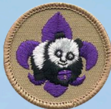
World Conservation Award