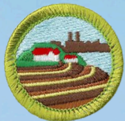
Soil and Water Conservation Merit Badge